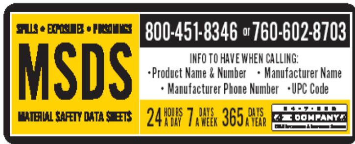
MSDS Horizontal Sticker