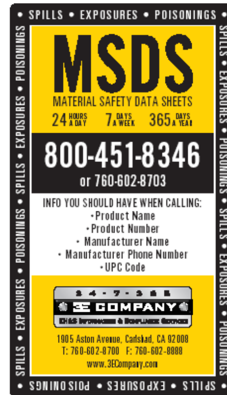
MSDS Card Front