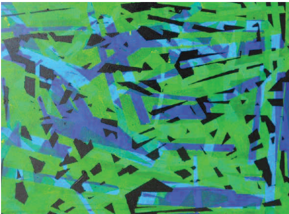
"All Taped Up" by the Seals Classroom

"A is for Art" has become a major event in the life of the SDSU Children's Center. Words can not convey the joy in the children's faces when they see "their painting" on display in a real art gallery. Each year they look forward to the time spend work with the visiting artists and their teachers, as they create a "masterpiece." With your help we can make the upcoming "A is for Art" events even more meaningful to the children and their families.