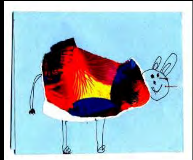
Balloon Art: Torn & made into an animal