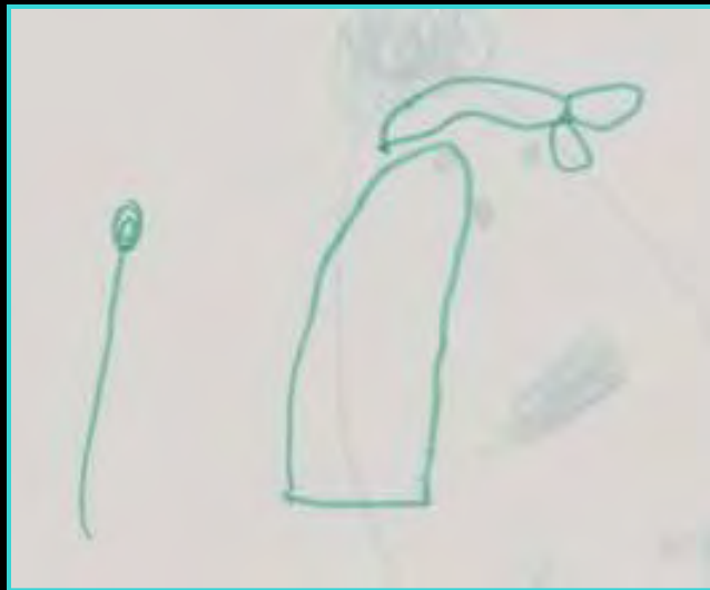
3.5 year old