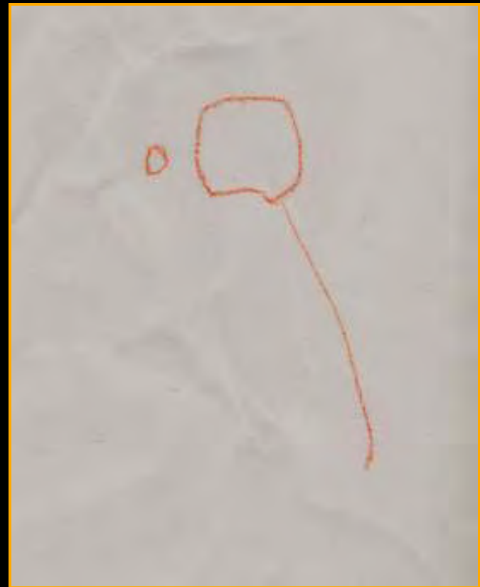
2.5 year old