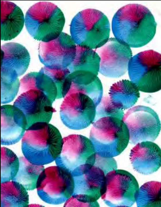
Balloon Art: Open Ended Discovery