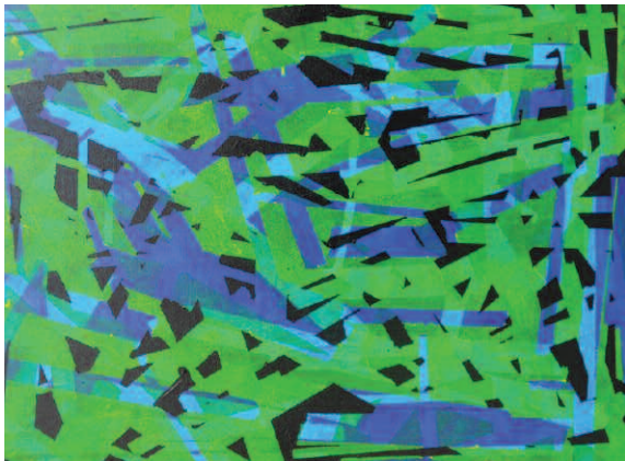
"All Taped Up" by the Seals Classroom

"A is for Art" has become a major event in the life of the SDSU Children's Center. Words can not convey the joy in the children's faces when they see "their painting" on display in a real art gallery. Each year they look forward to the time spend work with the visiting artists and their teachers, as they create a "masterpiece." With your help we can make the upcoming "A is for Art" events even more meaningful to the children and their families.